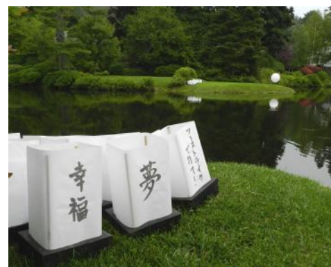
Floating lantern staging area